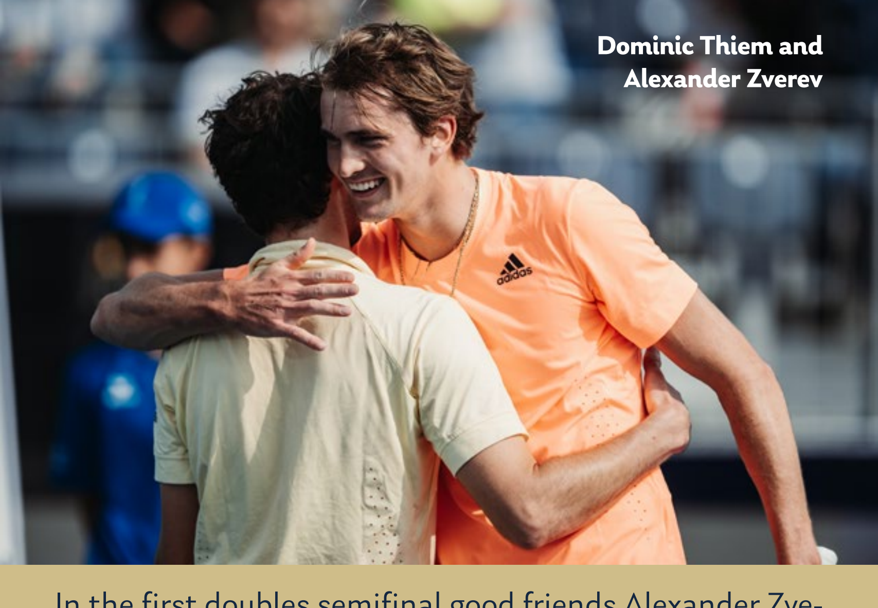
Dominic Thiem and Alexander Zverev

Not before 8:00 pm Great Britains number one Cameron Norrie will go against Indian Wells champion Taylor Fritz for a birth in the final of the Diriyah Tennis Cup presented by Aramco. Norrie had the upper hand in his first two matches with Nick Kyrgios and Stefanos Tsitsipas. He really enjoyed the buoyant crowd under the Diriyah Arena lights: "The fans really helped me through it," said Norrie. "Playing in a stadium like this also helps a great deal in my preparation for the season. It has been a very good day and the crowd really got into it. We're trying to inspire some of the younger Saudi players and I saw some kids and that's the reason I'm playing here to inspire a new generation.